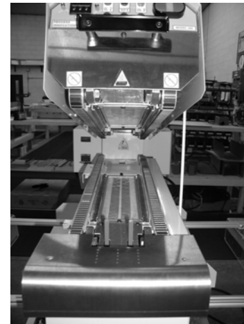
Standard 3.75" elements