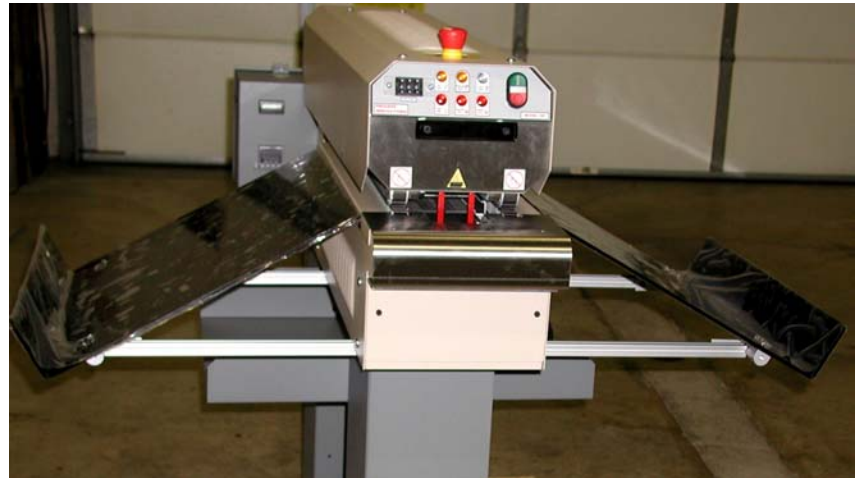
Model 185 with optional floor stand and Outboard Carriers.