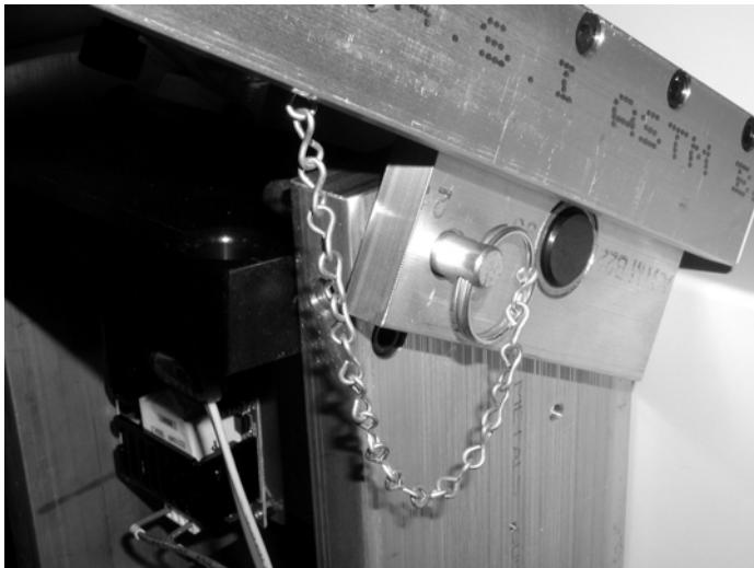
Service maintenance pin